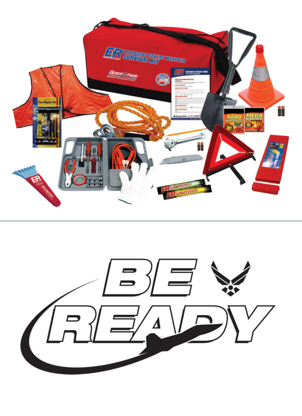
START PREPARING TODAY